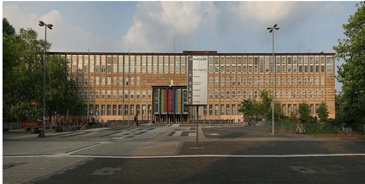
Wirtschafts- und Sozialwissenschaftliche Fakultät

Faculty of Management, Economics and Social Sciences